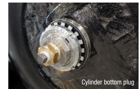
Cylinder bottom plug